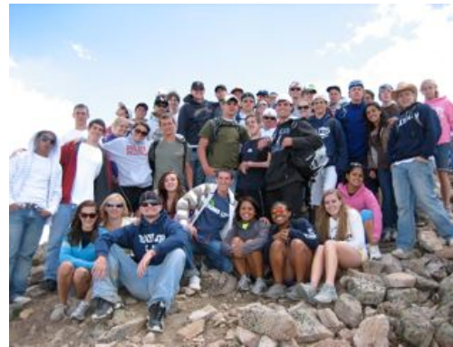
Students attend YL Summer Camps such as this one in Colorado.