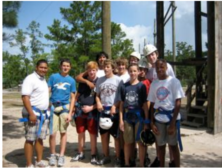
This is a group of Wyldlife kids who went to camp last year. This is just an example of the many kids involved in Young Life in Fort Bend County this year.

We look forward to your participation, along with other community residents at Sweetwater Country Club on Monday, March 23 2009. Whether you consider yourself a pro, amateur or hacker, there will be plenty of fun and competitive enjoyment for everyone.