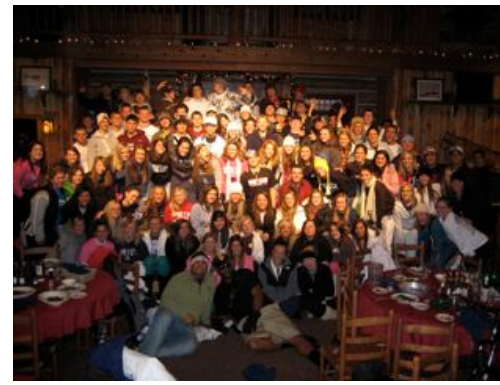
A group of YL kids at Ski Trip

www.fortbend.younglife.org 281-313-7636 - office